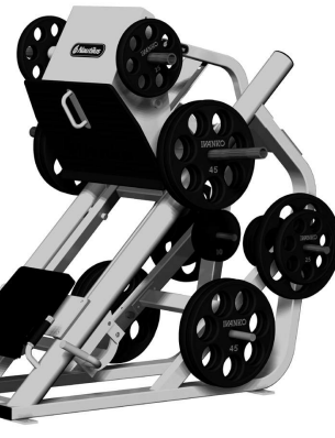
INCLINE LEG PRESS