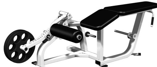
LEG CURL PRONE