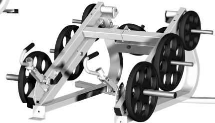
DEAD LIFT / SHRUG