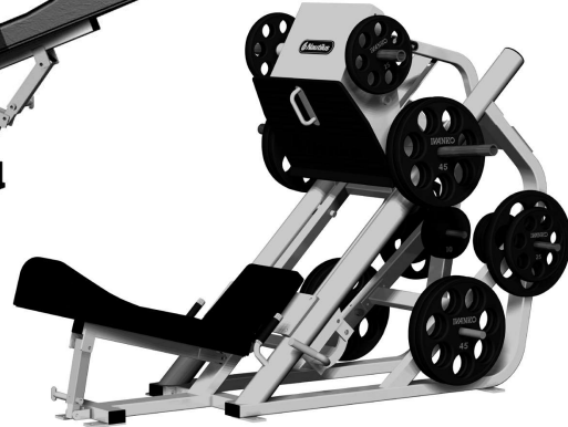
INCLINE LEG PRESS