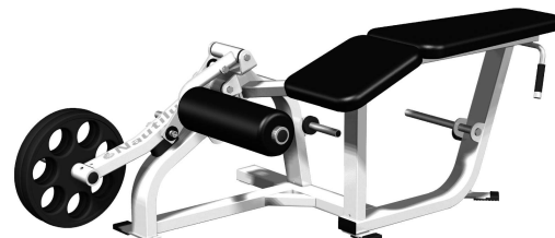
LEG CURL PRONE